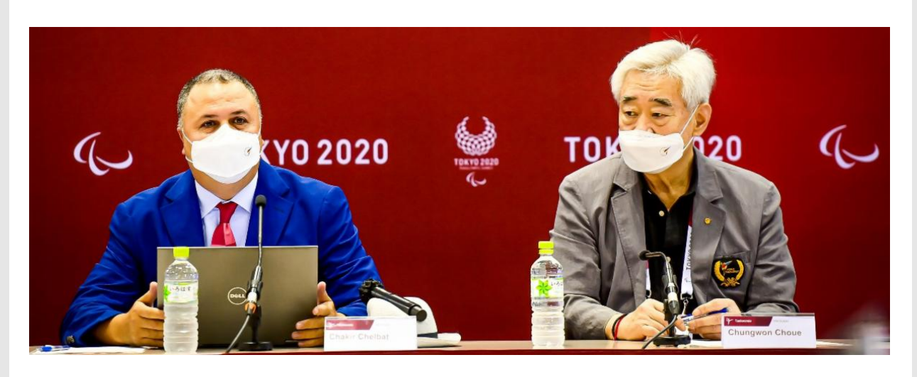
...and Looks Ahead to 2022