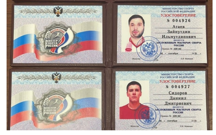
for their Paralympic achievements.