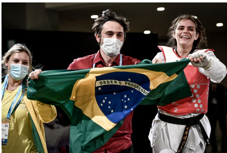
Paralympic Games in women's -58kg K44 event.

We hope to see more para-athletes at the German Open Poomsae 2024.